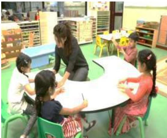
Figure 1: Teacher To Student Ratio