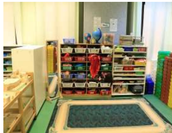
Figure 2: Classroom Environment

The classrooms are painted in neutral colors and the walls are not decorated, thus reducing visual stimuli and unnecessary distractions that can cause havoc to the autistic child. Because both classes run on the same timetable at the same time there are no noise distractions either (see Figure 2).