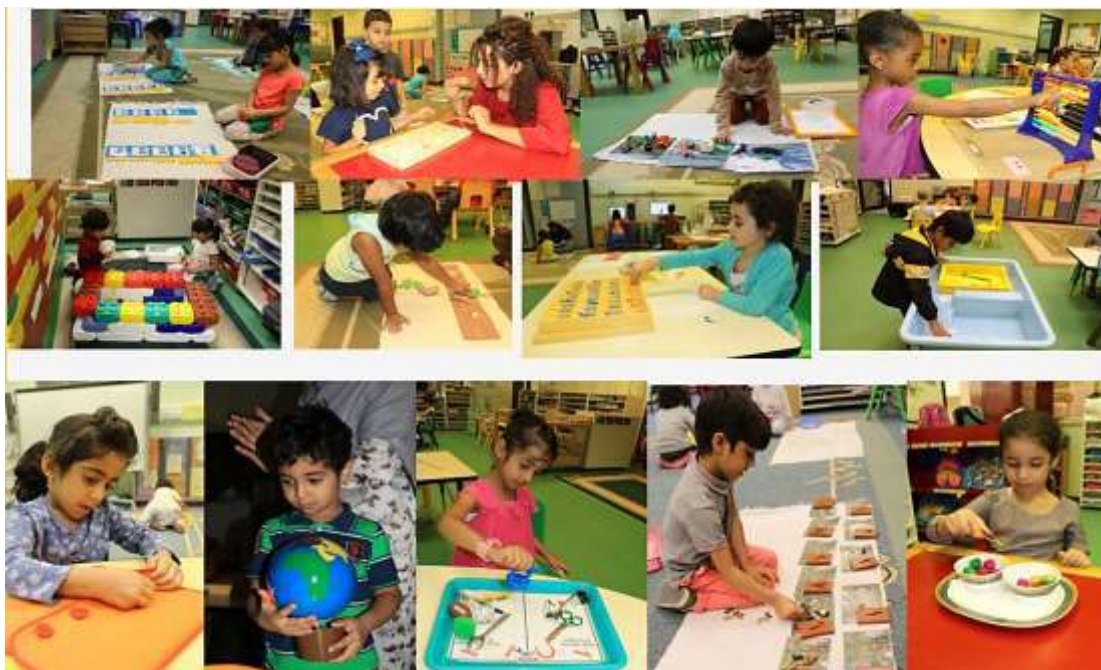
Figure 3: Individual activity

Because all activities are individualized, the child is always working at an appropriate level (see Figure 3). This reduces the frustration for the autistic child who may lack the communication skills to express their frustration appropriately. Individualized instruction also means that the child can work at their own pace. Autistic children often have a delayed response to verbal instructions and may take longer to process information and respond than the typically developing child. ( Teaching Students with Autism , 2000).