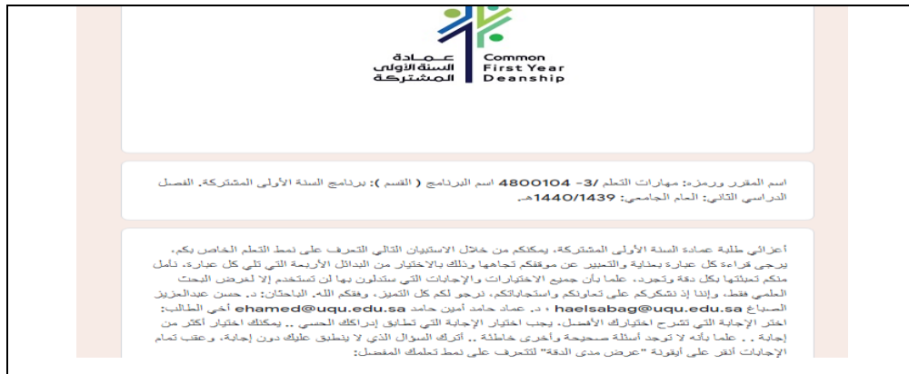
Fig. 1. The main interface of VARK Questionnaire