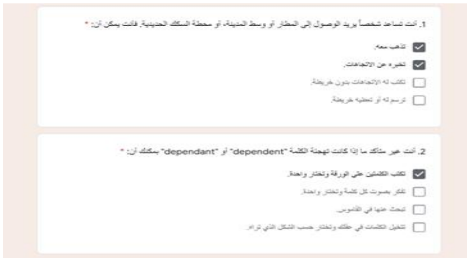
Fig. 3. Screenshot of the student respond

In order to calculate reliability and validity of learning styles questionnaire. The researchers selected a pilot sample consisted of 20 students to take part in testing the reliability of the questionnaire, Alpha coefficient was used to calculate the reliability of the questionnaire as revealed in the following table (2).