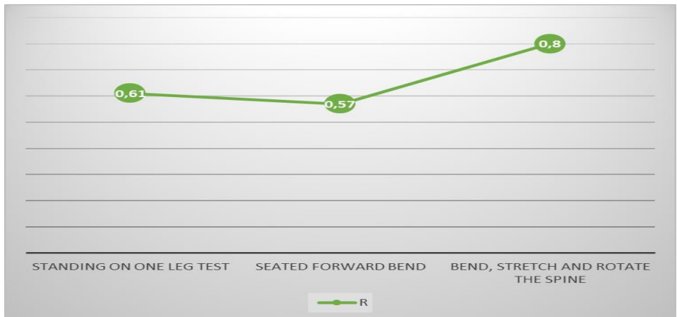
Figure (02) The graph of values of correlation coefficients between Non-transition skills and ADHD.

It is clear from Table (02) and figure (02) that the values of correlation coefficients between Non-transition skills and ADHD ranged between 0.57 and