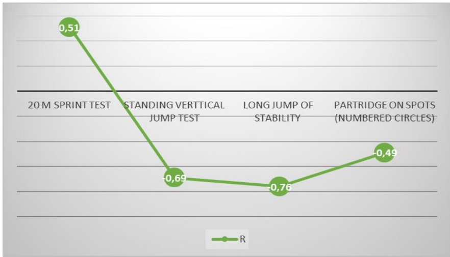
Figure (01) the graph of values of correlation coefficients between Transitional skills and ADHD.

It is clear from Table (01) and figure (01) that The correlation coefficients between Transitional skills and ADHD were estimated in the following order: 0.51, -0.69, -0.76, -0.49, which is a statistically significant at the significance level 0.05, Which confirms the existence of a statistically significant relationship between Transitional skills and ADHD, and this direct positive relationship (in 20 m Sprint Test) is statistically explained that the greater Transitional skills increases ADHD increase, but actually the test of 20 m Sprint used in the study As its numerical values increase the Transitional skills performance will be weak, hence we deduce from test that by an increase of ADHD, the accuracy of the performance of Transitional skills, but by reference to the type of relationship between The two variables we find it a negative relationship and unlike this result is explained in adhd test as: the numerical value indicates that the smaller the numerical value or the total summation of this test, the greater the disorder in the adhd will be and the more the numerical value is, it indicates that the child does not suffer from adhd.